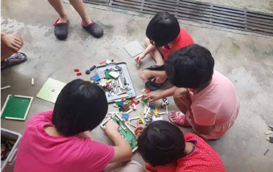
They're playing with LEGO, creatively building houses and cars