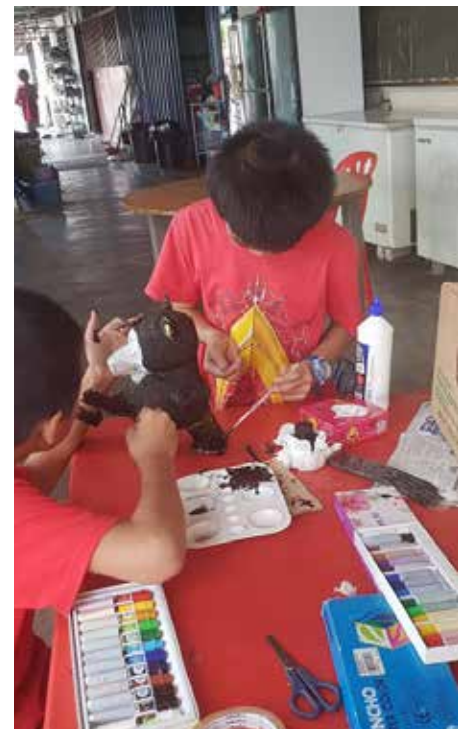
Our children here learn how to thrift on these supplies and make every ink count.

At House of Love, we provide art supplies (ie watercolor sets, crayons etc), as donated by the public for our children's use for school work.